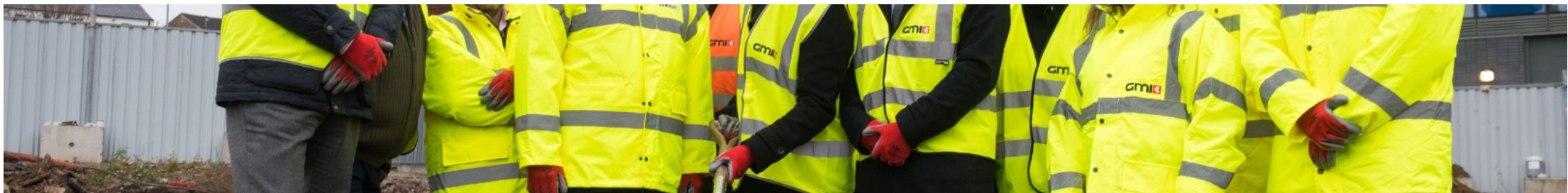
Work Starts at 2 Stockport Exchange